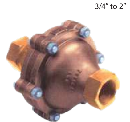
3/4" to 2"