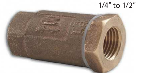
1/4" to 1/2"

Accuracy \pm 10\% when operating in the range 15 to 200psi (1.06 to 14kg/cm 2 ) pressure difference.